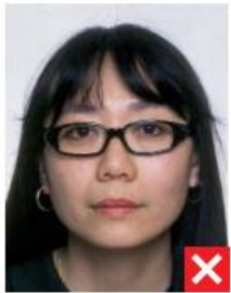
frames too heavy