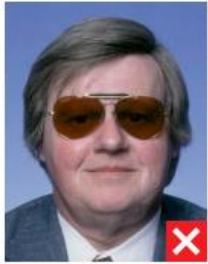
dark tinted lenses

DIRECTORATE FOR SPORTS AND SOCIAL PROJECTS