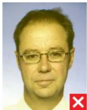
unnatural skin tones