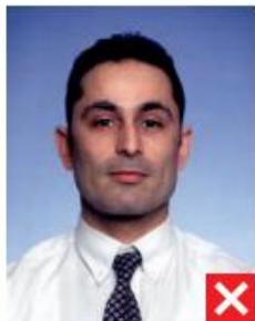
too far away