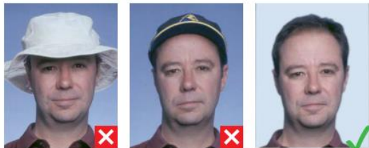
wearing a hat

DIRECTORATE FOR SPORTS AND SOCIAL PROJECTS