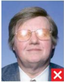
flash reflection on lenses