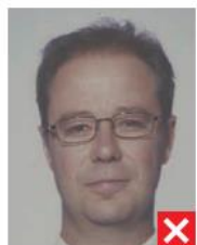
washed out colour