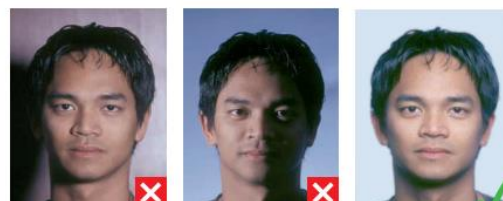
shadows behind head