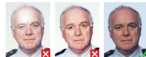
flash reflection on skin