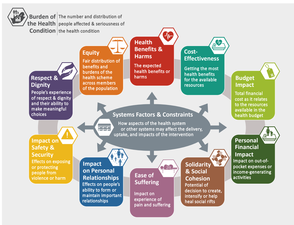
Figure 1: SAVE-UHC Ethics Framework Snapshot

As indicated in the figure, two of the domains in the Framework operate somewhat differently from the other 10, and those are presented first. Systems Factors & Constraints , in the centre of the diagram, shows that context-specific features of the health system and broader infrastructure can have cross-cutting implications for how the delivery of the health intervention may play out — decisionmakers should think about this real-world context when assessing the other domains. Because this domain is cross-cutting, affecting considerations under other domains, the general considerations are laid out first, then more specific “Systems Factors & Constraints” considerations are identified throughout the Framework under each domain using this icon: