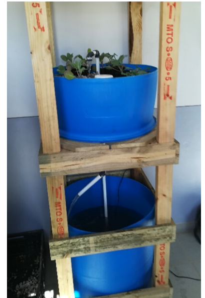
Experimental aquaponic system piloted by Naastdrift Primary in the West Coast District

To date, aquaponics projects have been installed at four pilot schools: Koekenaap Primary, St. Boniface Primary, Naastdrift Primary and Nieuwoudt Primary. The systems were installed by Powerponics, which specialises in aquaponic and hydroponic systems for disadvantaged communities. Powerponics provided the labour, while the Forum made funds available for the system materials and Stellenbosch University, also a Forum member, provided training to pilot school gardeners and staff as well as other Forum members. A fifth school, Steilhoogte Primary, is currently building a larger scale system. The university will now mentor and guide schools in successful management of the systems. If schools can continue to successfully manage systems after being mentored, aquaponics systems will be a very valuable tool to save water and introduce learners to new and exciting technology. It offers opportunities for lower-cost growing and the sale of fish as an additional product. Aquaponics systems can further be integrated in the curriculum with training on, amongst many other things, ecosystems.