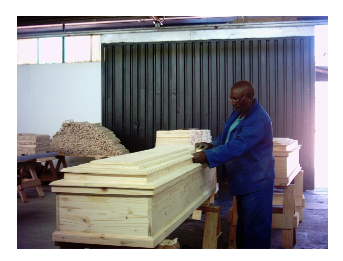
Photo 4: One of the workers at the Campus's coffin manufacturing site.

The laundry project has also seen some success (Refer to photo 5). The campus has managed to sign a contract with "Masakani", a provincial laundry company, whereby the people involved in the laundry project will be cleaning overalls. As a result, the campus is in the process of expanding the laundry facility and will be installing a special laundry machine that will remove paint stains.