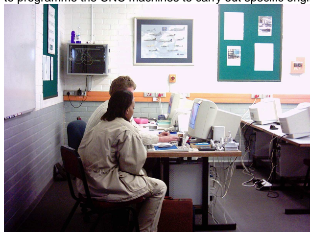
<u>Photo 1</u>: One of the female learners busy with the CNC computer-programming course with the lecturer. Here, she is learning how to programme the CNC machines to carry out specific engineering tasks.

The project also generates funds from training that are ploughed back into the project, i.e., with 20% of private learner enrolments (not part of the bursary) using the SAAB equipment and technology for training.