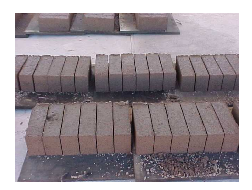
<u>Photo 2 (left)</u>: Manufactured bricks by those involved in the brick-making initiative. <u>Photo 3 (right)</u>: A group of men enrolled in the Nissan project, busy with the manufacture of SABS approved bricks.

For quality assurance purposes, the campus ensures that courses are of the highest quality. For example, in the brick-making course, bricks are made according to SABS standards and are SABS approved (Refer to Photo 2 and 3). Similarly, the vegetable drying project is done according to the required food standards of THETA, while the laundry project follows industry standards.