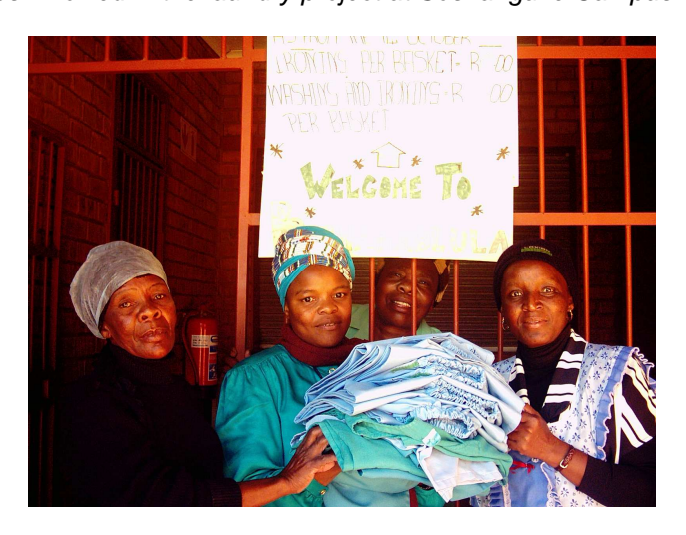
Photo 5: Three ladies involved in the laundry project at Soshanguve Campus.

Soshanguve campus has the responsibility of keeping track of who was trained and aims to get the learners placed into workplace environments to gain practical work experience. Their target is to place at least 80% of all trainees.