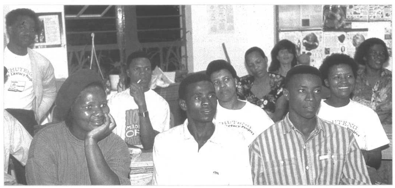
Joint Education Trust BULLETIN No. 8 - July 1998 - Page 9

Finally we must ask why, in major discussion documents issued by the Department of Education, RPL is either not prominent or is dealt with in contradictory ways. It may require an analysis of the direct financial implications of RPL to understand who is afraid of it, and why.