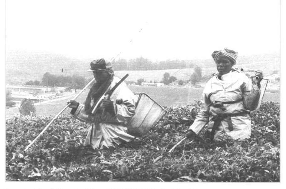
Page 4 - Joint Education Trust BULLETIN No. 8 - July 1998

In March a bosberaad of Sapekoe management and union shop stewards produced enthusiastic support for a proposal to engage the tertiary institutions in development of a learning system in Firstline Management. It was envisaged that such a programme would initially be made available to 200 employees. It would need to be structured in such a way that it would build on the considerable work experience of adult learners, grant recognition