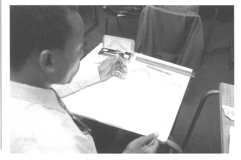
Joint Education Trust BULLETIN No. 8 - July 1998 - Page 13