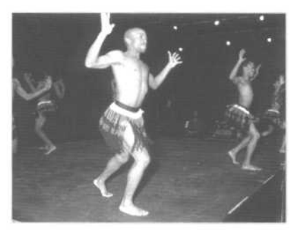
At the Market Theatre in Johannesburg Moving into Dance held the audience spellbound with extracts from two award-winning performances: Tlotlo and Speaking with Tongues.

This year JET's Annual Review Meetings took on a new format encompassing performances from just a few of the projects with which the Trust has been involved. The participating projects offered guests a view of where and how funding managed by JET connects with on-theground delivery, creating learning opportunities amongst disadvantaged communities.