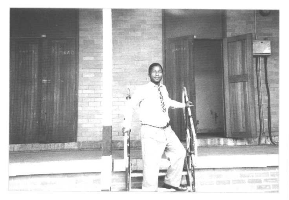
After being accredited as a registered tour guide, a budding entrepreneur stands outside his newly acquired business premises.

Support and Aftercare Services. The choice of these three categories is supported by the literature on support services to SMMEs (small and medium enterprises).<sup>12</sup>